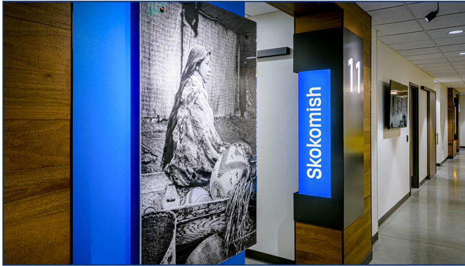
An Edward Curtis photograph (1913) depicting a Skokomish Indian chief's daughter graces the entrance to the Skokomish portal at Mason Clinic. This photograph was donated by the Skokomish Tribe.

Many have described stepping into Mason Clinic as taking a journey into the history of Mason County, as if one were walking through a museum or an art gallery.