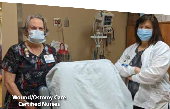
Wound/Ostomy Care Certified Nurses