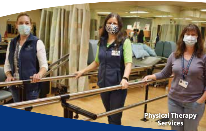
Physical Therapy Services