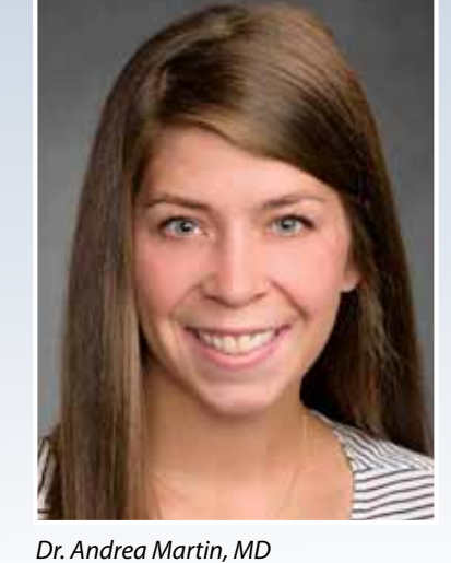
- Service from the Heart Commendation "You were the most personable, knowledgeable and down-to-earth doctor I have ever had. Thank you."